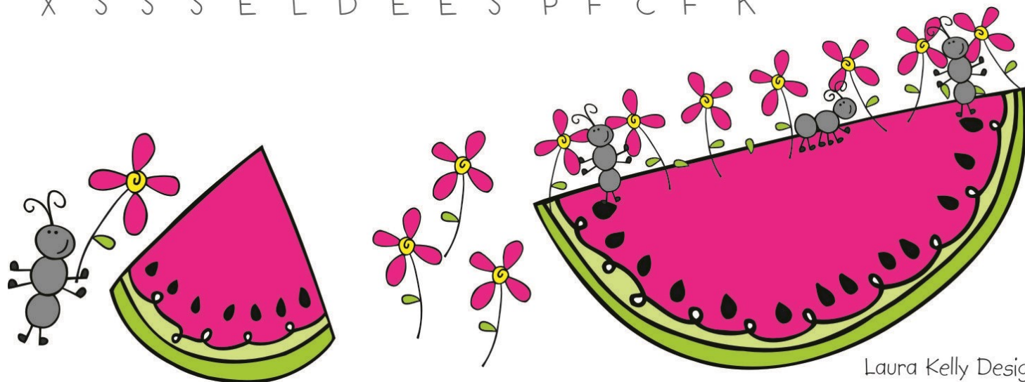
Laura Kelly Designs

FARM FRUIT GARDEN GREEN HEALTHY HYDRATE JUICE MARKET ORANGE RIND SEEDED SEEDLESS WATERMELON YELLOW