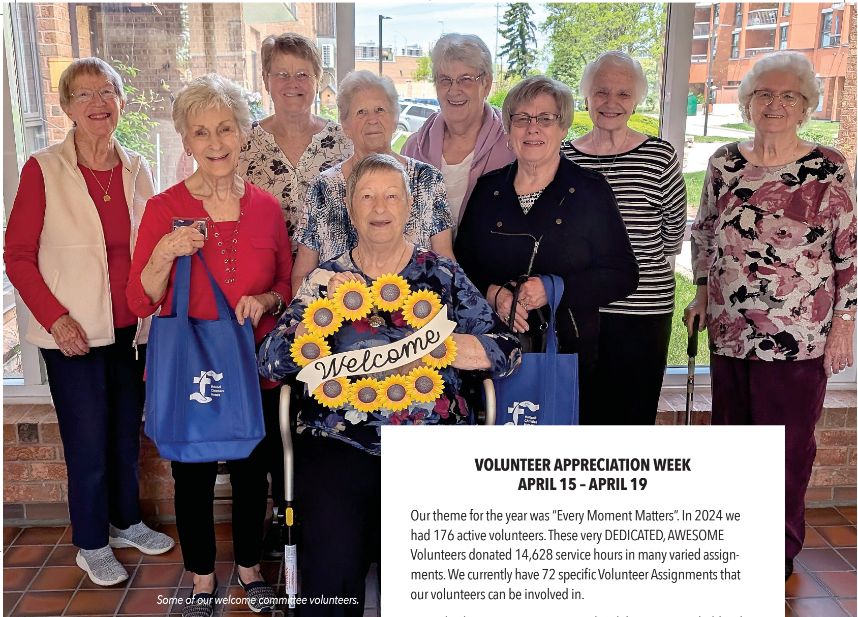
Some of our welcome committee volunteers.