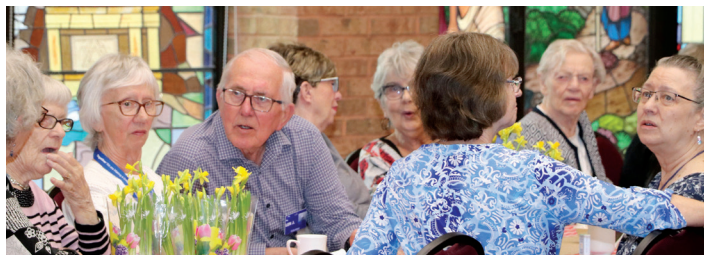
A few of our wonderful volunteers.

We had 10 Volunteers with 5 Years of Service, 7 Volunteers with 10 Years of Service, 3 Volunteers with 15 Years of Service, 4 Volunteers with 20 Years of Service and 1 Volunteer - with 30 Years of Service! Amazing!