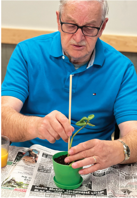
Engaging in horticultural therapy.